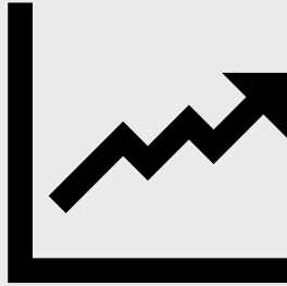
Commercial transportation demand trend